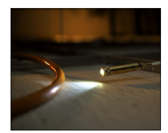
The Cable Scout<sup>+</sup> Beam - a perfect tool for seeina into cavities.