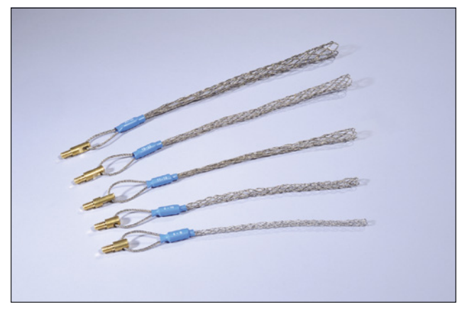
Cable Grips are available in five different sizes to attach a wide range of cable diameters.