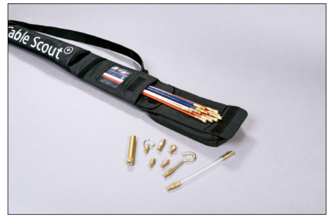
All components stored neat and tidy with the Cable Scout+ Deluxe set.