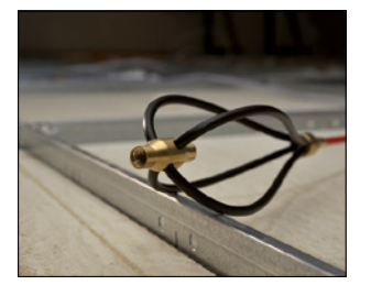
The whisk allows the rod to glide over obstructions easily.