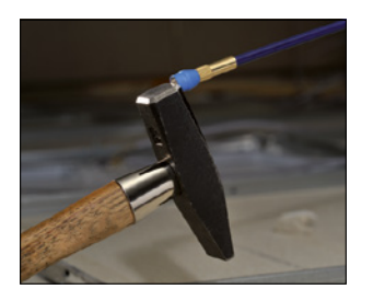
The strong magnet lifts a metallic tool of up to 2.5 kg.