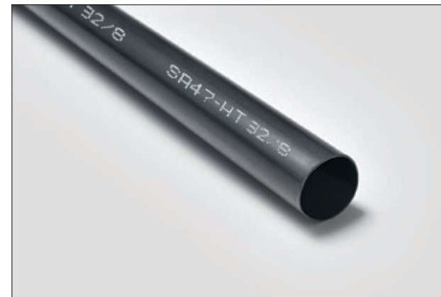
Heat shrink tubing SA47-HT for 150°C application.