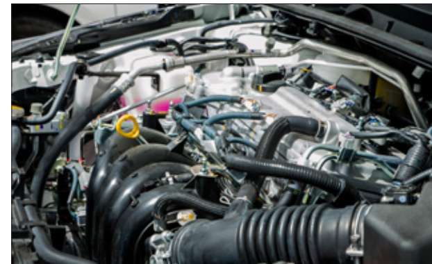
SA47-HT provides optimum protection against moisture in high temperature applications.

SA47 has been developed with our Automotive partners to eliminate the risk of corrosion around cable splices and terminations.