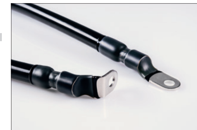
Heat shrink tubing SA47-LA for cable connection.

SA47 has been developed with our Automotive partners to eliminate the risk of corrosion around cable splices and terminations.