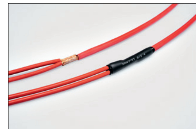
Heat shrink tubing SA47 for splice application.

SA47 has been developed with our Automotive partners to eliminate the risk of corrosion around cable splices and terminations.